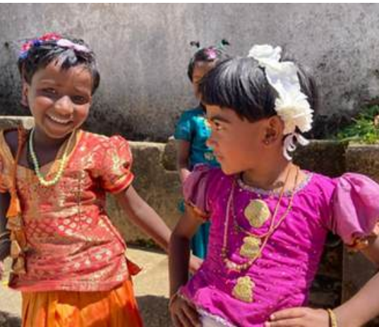
Thai Pongal Celebrations

Cultural celebrations play a vital role within the CAL community, creating opportunities for children and youth to discover, appreciate, and celebrate the richness of diverse traditions and beliefs. Through shared experiences, young people learn empathy, acceptance, and collaboration – strengthening bonds and laying the foundation for more peaceful, resilient, and united communities that can work together toward lasting development and transformation.